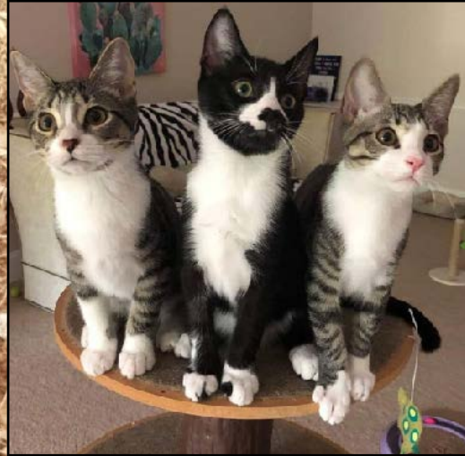
Meet Dora, Isabelle & Tito

My name is Atlas and I am 3 years old. I am very loyal and watchful of my human. I am extremely smart and I do not runaway because I'm happy to be in a home. I can be shy in new surroundings but once I'm comfortable, I am full of energy. I love to swim, run and play catch. I am not used to being around a lot of other dogs, but one on one I do pretty well and will even play. I have not been around tiny humans but I do well with older children. I am a great snuggler and the champ at Tug of War. Please come meet me!