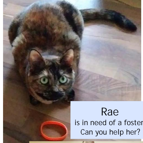
Rae is in need of a foster. Can you help her?

Check out some of CCA's adoptables. To learn more about them, go to "Adopt" at CCAweb.org . Please email CCAadoptions@gmail.com to inquire about adoption, fostering or foster to adopt.